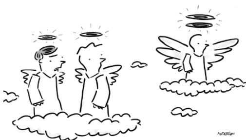
"Check out Mr. Holier-than-thou!"