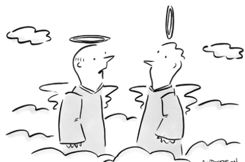
"You should get that looked at."